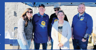
Campaign fundraiser at Walmart