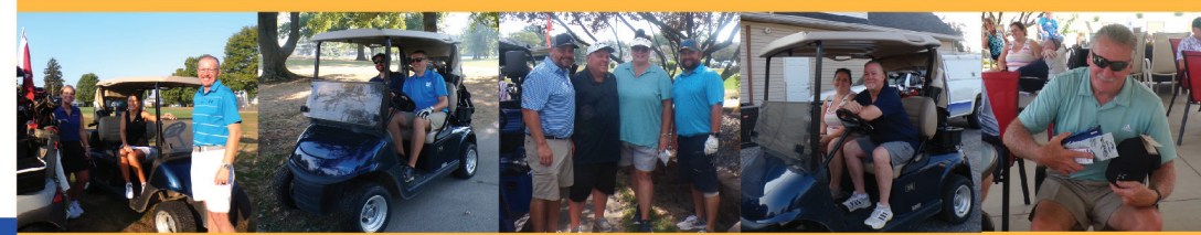
We had our 1st annual golf scramble at the Washington Country Club! It was a success, raising over $6,000 towards our Campaign efforts!