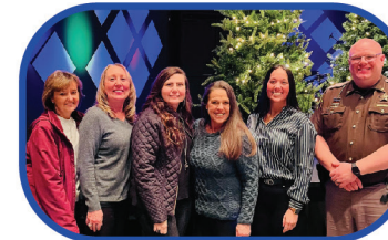
Serving our youth in the Daviess County CEO Program—mentoring & presenting for 8 years